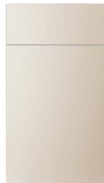
Slab door Thermofoil

Choose from 4 finishes High Gloss also available for up charge. See store for samples.